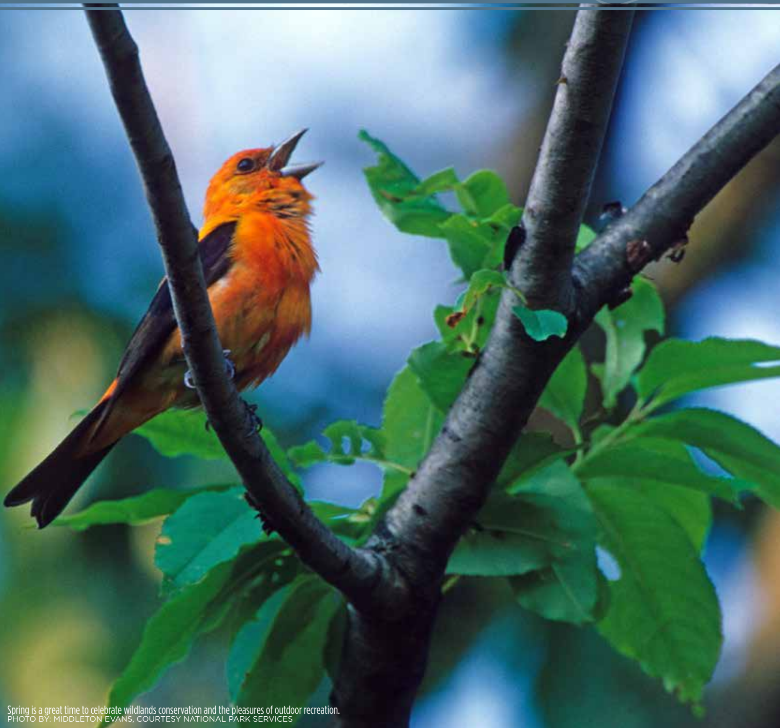
Spring is a great time to celebrate wildlands conservation and the pleasures of outdoor recreation.