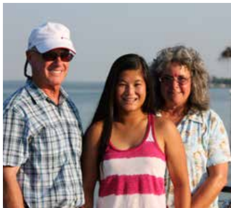
The family who hosts the Osprey cam welcomes the new season!

Fledging four young requires a very rich food regime, and a very vigorous male supplier of fish. It is sometimes seen