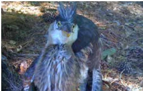
Baby Heron