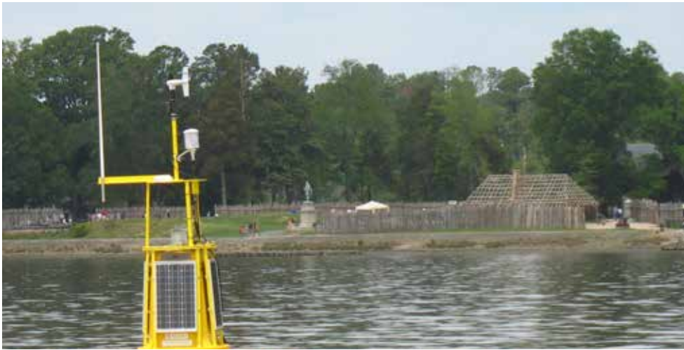
Proponents of the trail also garnered support for an innovative trail marking system, developed by NOAA. The first of the interpretive buoys was deployed in the James River, in view of Historic Jamestowne.