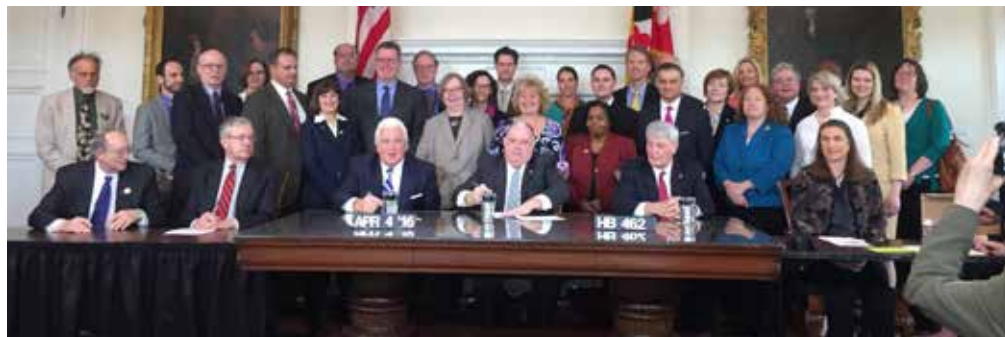
Maryland Governor Larry Hogan and the legislative leadership deliver on their promise to restore funding to Program Open Space, April 2016