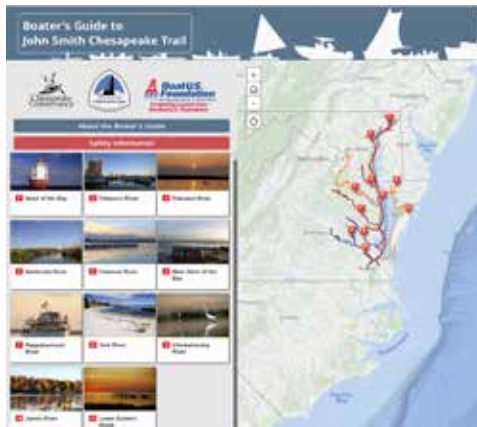
A computer screenshot of the Boater's Guide app

The online guide was innovative for its time, with hyperlinks to GIS data, NOAA charts, and contact information.