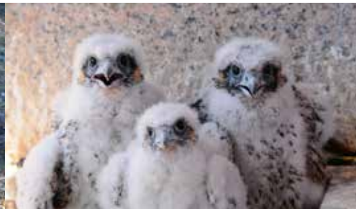
Baby Falcons