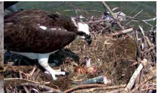
Baby Osprey