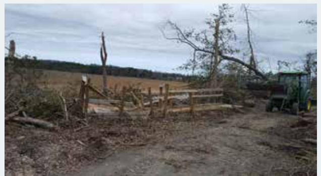
Cleaning up tornado damage on the Hutchinson Tract, Rappahannock River Valley National Wildlife Refuge

optimism when surrounded by nature rebounding from catastrophe. Plants and animals have an uncanny ability to recover from natural disasters, and on the Hutchinson Tract, they will show us traits to emulate as we carry on with our lives.